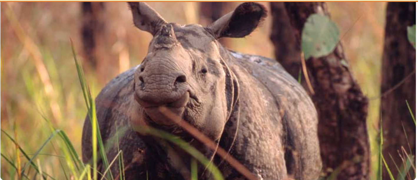
Greater one-horned rhino, Royal Chitwan National Park, Nepal.

The Terai Arc Landscape is part of the Terai-Duar Savannas and Grasslands Ecoregion – one of WWF's Global 200 Ecoregions, biologically outstanding habitats where WWF concentrates its efforts.