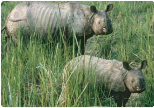
Greater one-horned rhino, Royal Chitwan National Park, Nepal.