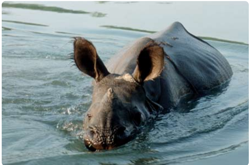
Young greater one-horned rhino.

Historically hunted for their horn, a prized ingredient in traditional Asian medicines, and devastated by the destruction of their lowland forest habitat, Asian rhino populations are now distressingly small. These animals are among the world's most endangered, with one species numbering only around 60 individuals. Throughout their range, their habitat continues to dwindle fast due to illegal logging and other human pressures, and the threat of poaching is ever-present.