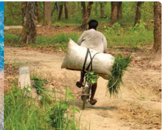
Local resident carrying off grass harvested from Terai Arc Habitat, Nepal.