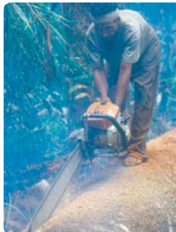
Illegal logging, Sumatra, Indonesia.

3. The Critically Endangered Javan rhino is also known as the lesser one-horned rhino, and is probably the rarest large mammal species in the world. Only around 60 individuals are thought to survive in the wild, and there are none in captivity. The Javan rhino historically roamed from north-eastern India through Myanmar, Thailand, Cambodia, Lao PDR, Vietnam, and the islands of Sumatra and Java (Indonesia). Today, just 50–60 remain in Ujung Kulon National Park in Java, and no more than 10 survive in Cat Tien National Park in Vietnam. Both groups belong to distinct sub-species.