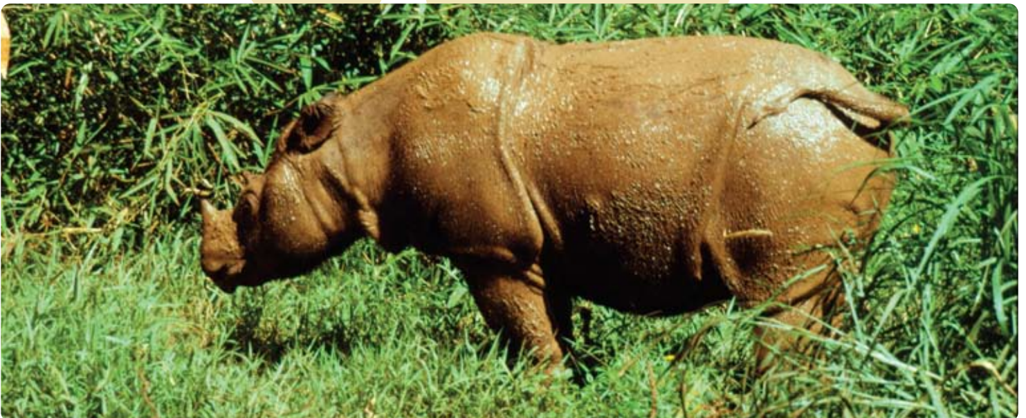
Sumatran rhinoceros.

7. Throughout all rhino habitats, WWF and TRAFFIC – the international wildlife trade monitoring network organized and operated as a joint programme by and between WWF and IUCN–The World Conservation Union – monitor the illegal trade in rhino horn, fund anti-poaching patrols, and support intelligence networks in strategic locations to prevent over-exploitation of rhinos for international trade. Work is also ongoing with practitioners of traditional Asian medicine to find and promote alternatives to rhino horn.