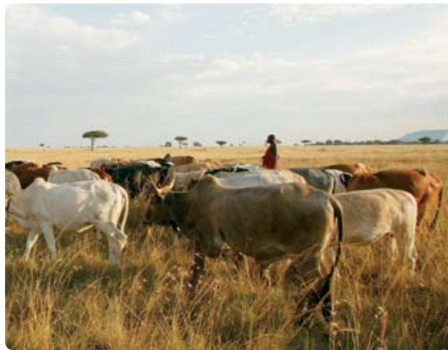
"Watch tower" to see approaching elephants, Kenya. Masai boy taking his herd back home, Kenya.