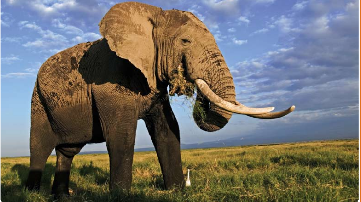
African elephant, Kenya.

A powerful symbol of nature, the world's largest land animal is still under threat