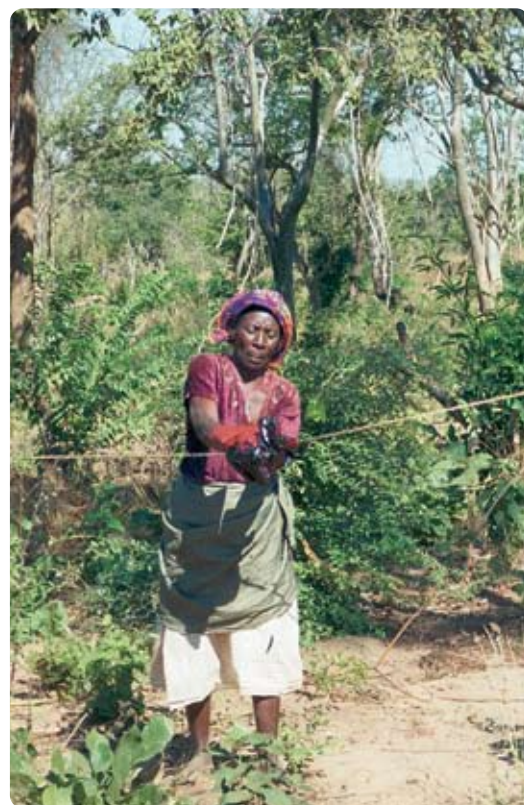
Villagers use chili-soaked ropes to stop elephants from destroying their crops, Kenya.