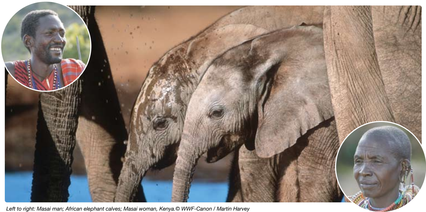
Left to right: Masai man; African elephant calves; Masai woman, Kenya.